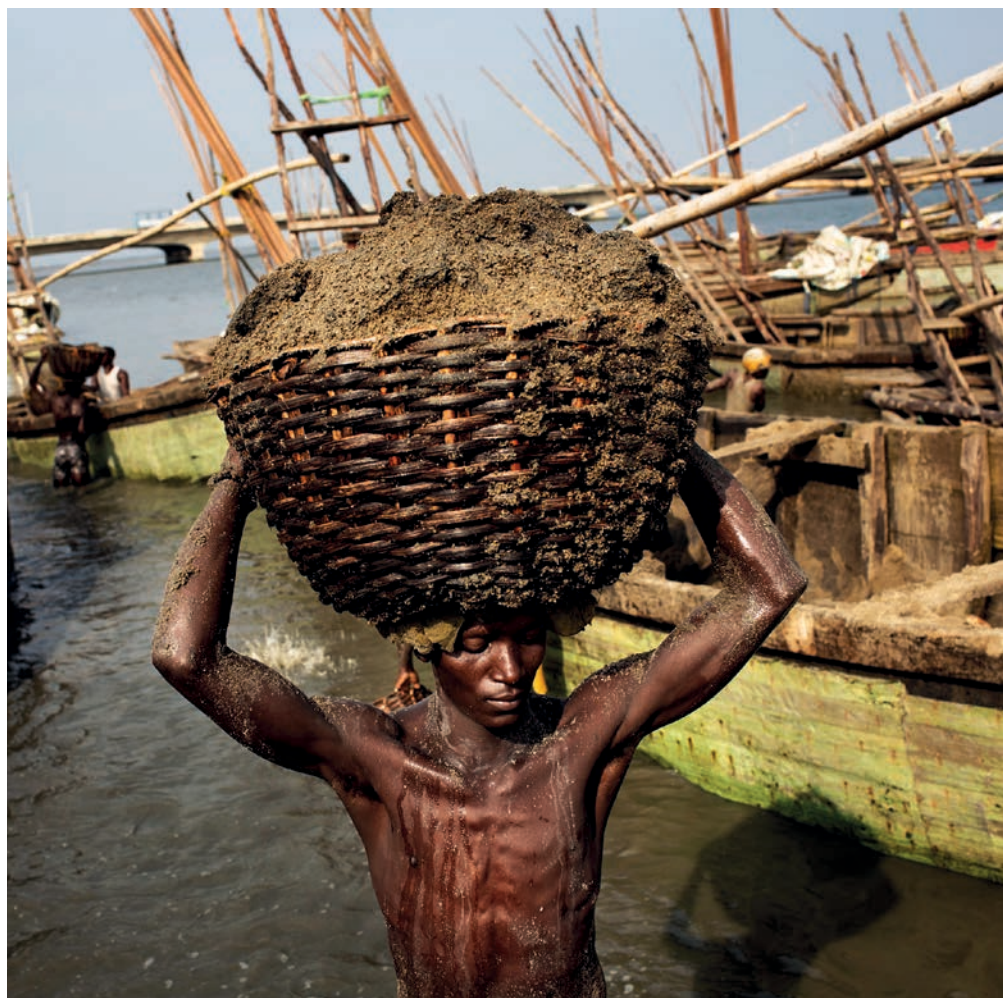
In Lagos Lagoon in Nigeria, labourers dig sand from the sea floor by hand.