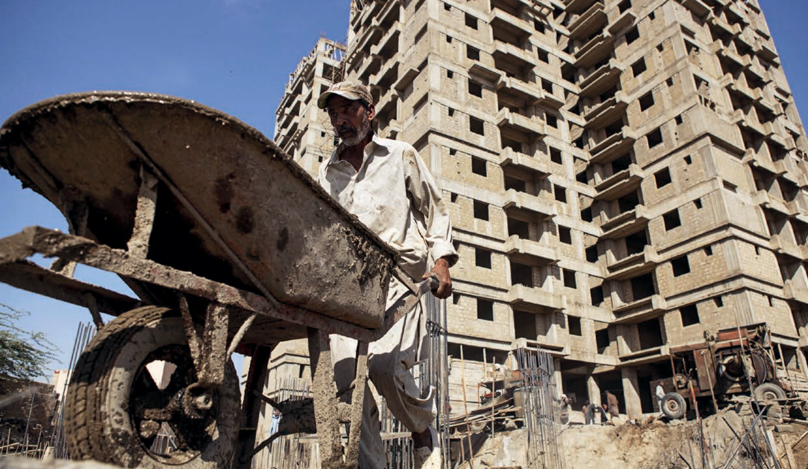
Rapid urbanization and population growth is driving demand for sand for construction in cities such as Karachi in Pakistan.